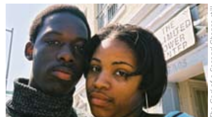
The God of a Second Chance still